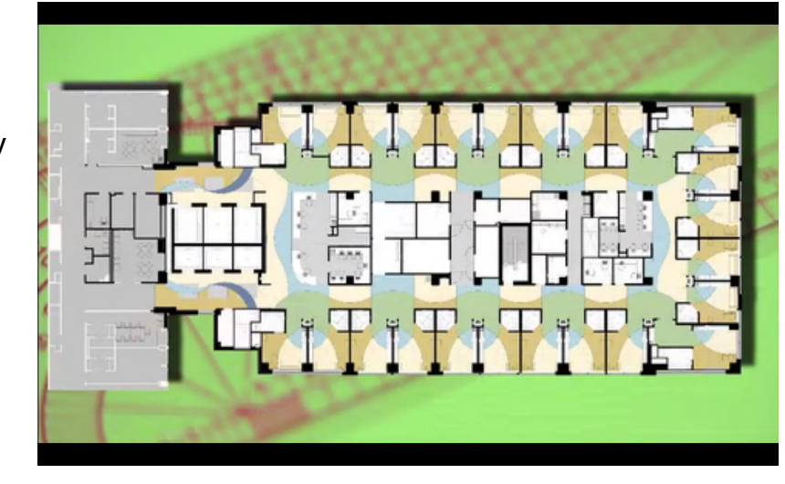
Figure 1. South Patient Tower Floor Plan

Patient Tower inclue 174 private intensive care and medical/surgical patient rooms for a total of 236,000 square feet. The floor plans are relatively repeatable. Therefore SIPS is considered as a potential solution to the problem. The probability of the implementation of SIPS still needs to be further studied and researched.